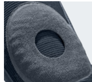
Maximum relief of the patella due to the open border of the silicone patella ring