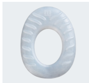
Pad with 3D profile